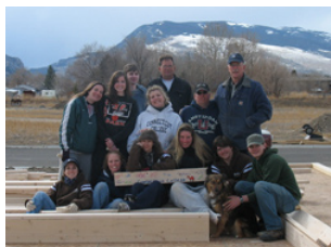
Habitat for Hum. in Cody, Wyo.

This spring break Connecticut College students will engage in at least four different alternative learning/service spring break projects, spanning the country and the globe, from Alabama to Africa. Students working with Habitat for Humankind will be building houses in both Alabama and Pennsylvania. In New Orleans, a student-organized project will focus on restoring and maintaining the largest public park in the city in hopes of creating safe and appealing green space for everyone. A student working with Asayo's Wish Foundation will help bring much needed medical supplies and work with children at an orphanage in Kaberamaido, Uganda. If opportunities such as these interest you, contact OVCS (x2958) for more information about the trip leaders and to connect with an institutional committee exploring ways to solidify all break programs.