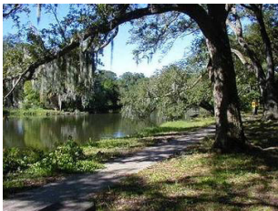
New Orleans City Park